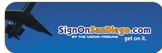
Preferred Logo on a Dark, Busy Background (DTbck)

This is the logo to use when the artwork appears on a white “paper” background.