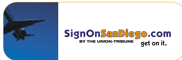
Preferred Logo on White “Paper” Background

In situations where the logo appears on a dark, busy background, with a screen density of 35% to 100%, use the DKbck Logo with a white outline around the main, full-color signature and reversed-white taglines.