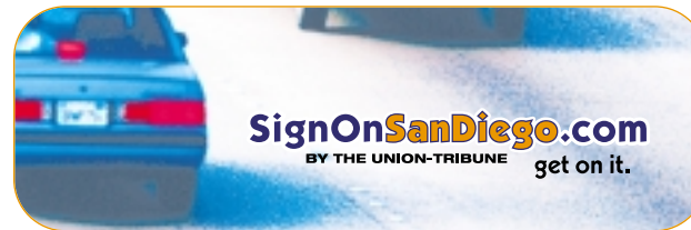
Preferred Logo on a Light, Busy Background (LTbck)

This is the logo to use when the artwork appears on a dark, busy background.